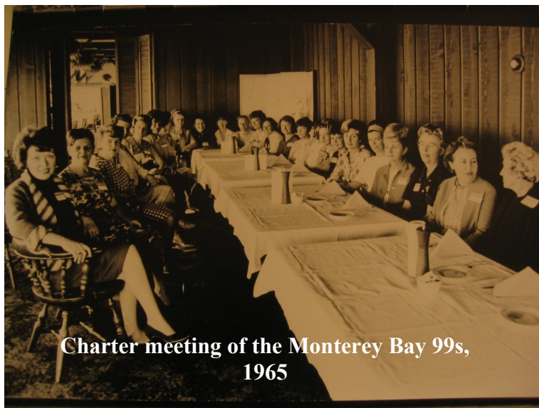
Charter meeting of the Monterey Bay 99s, 1965